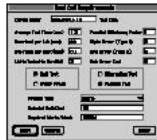
Navigate with a test floor specific user interface.